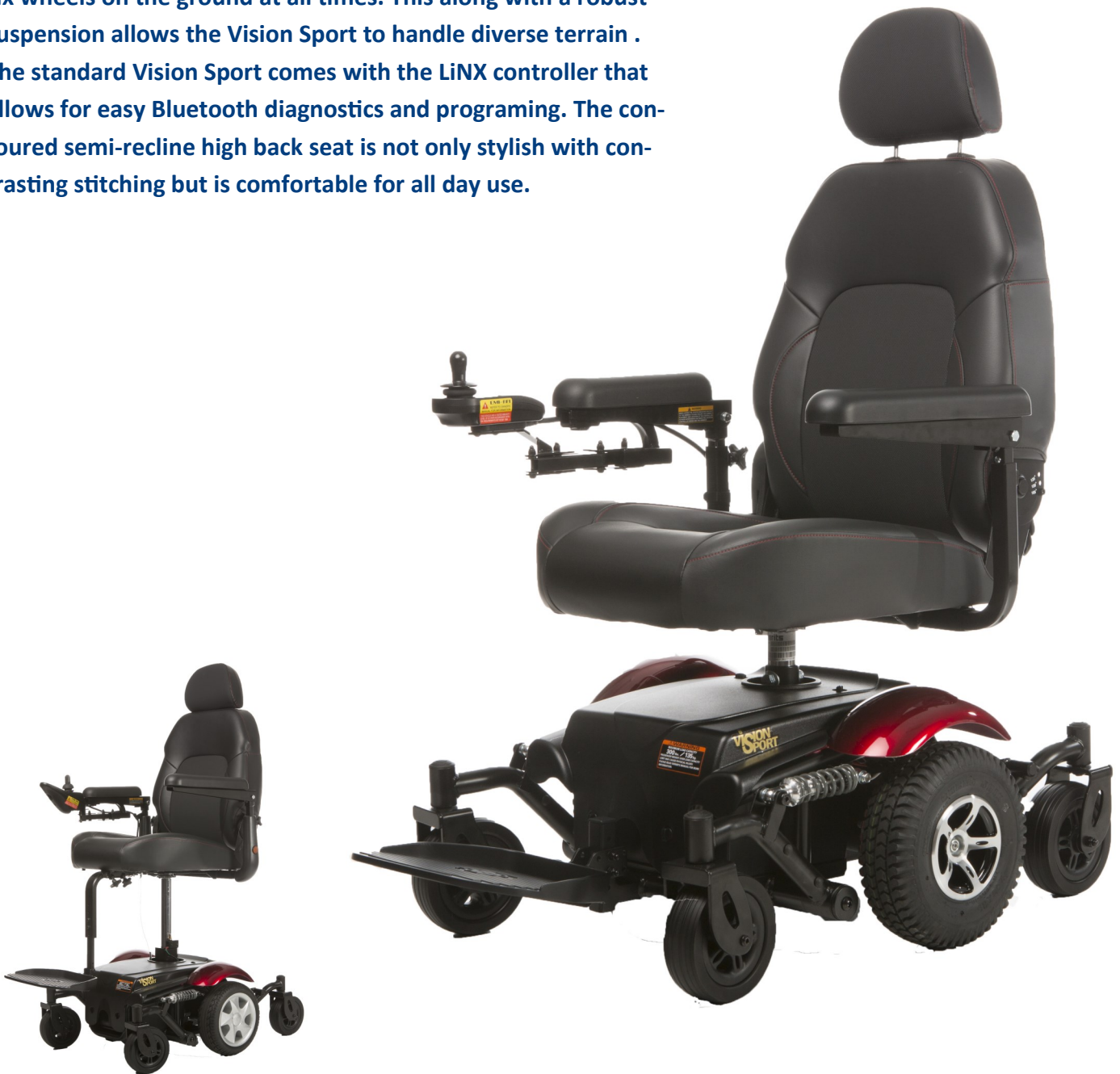
Vision Sport with Seat Lift

The Vision Sport is a true center wheel drive power chair with six wheels on the ground at all times. This along with a robust suspension allows the Vision Sport to handle diverse terrain . The standard Vision Sport comes with the LiNX controller that allows for easy Bluetooth diagnostics and programing. The contoured semi-recline high back seat is not only stylish with contrasting stitching but is comfortable for all day use.