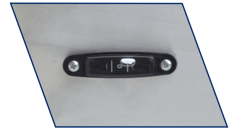
Safety Guide Bubble Level