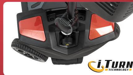
Patented, intelligent-turning, iTurn Technology®.