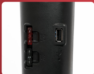
USB charger built into tiller