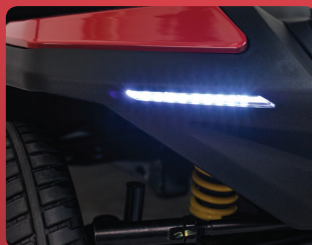
Front LED lights