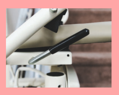
Swivel seat for a safe exit