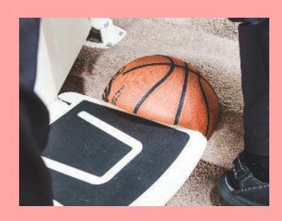
Safety obstruction sensors.