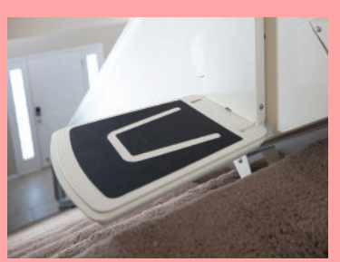
Wide footrests for stability and extra comfort.*

*Wider foot rest vary slightly in style on each Pinnacle model. See model detail for more information.