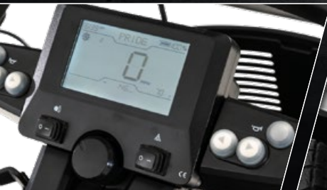
LCD digital display

** Only one rear accessory can be used at a time.