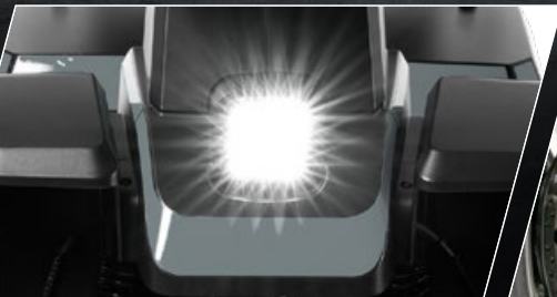
Enhanced LED headlight