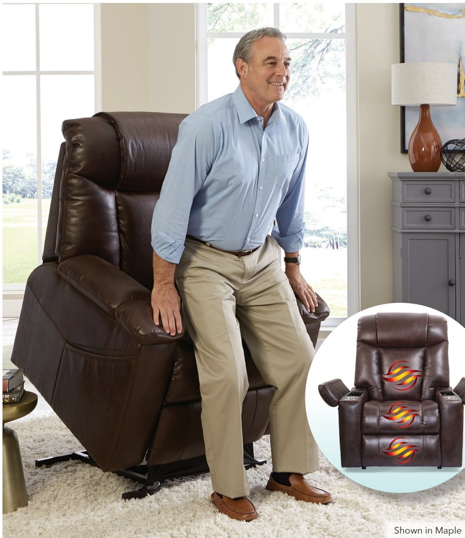
Shown in Maple