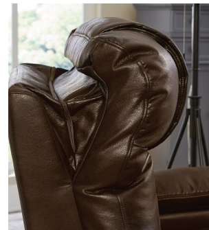
Adjustable Headrest & Lumbar