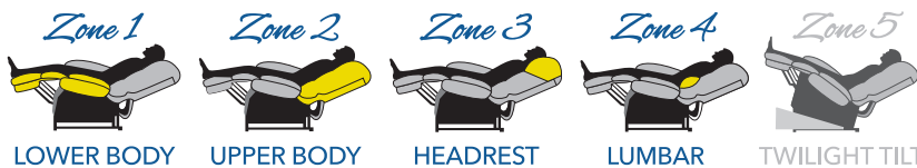
LOWER BODY UPPER BODY HEADREST LUMBAR TWILIGHT TILT

Comfort Zones 1 - 4 provide an ergonomic comfort experience with an emphasis on head and back support. Each Comfort Zone can be adjusted independently by using the exclusive AutoDrive hand control.