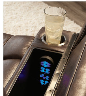
Right Arm: Cup Holder & Storage Compartment

The Rhea comes standard with the following comfort and convenience features: