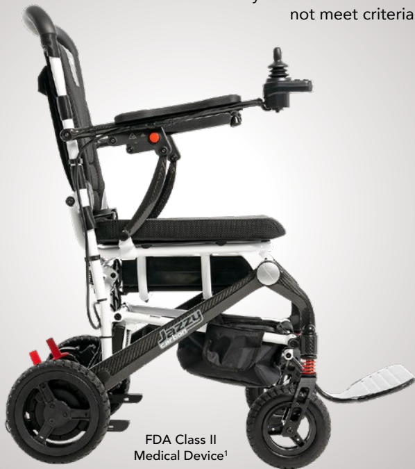
FDA Class II Medical Device 1

K0899 POWER MOBILITY DEVICE: Not coded by DME PDAC or does not meet criteria