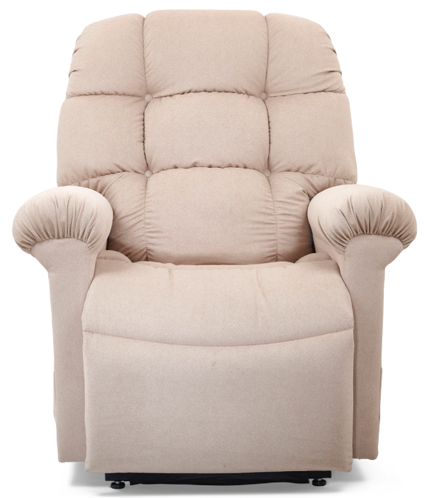
Shown in Camel