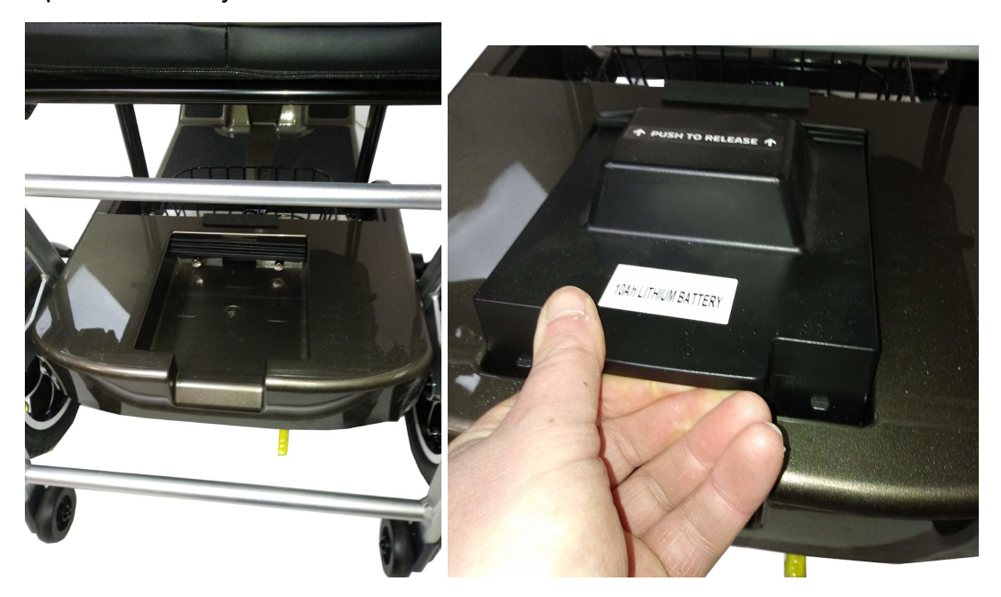
[Fig 6.1.0] [Fig 6.2.0]

To insert the battery box, simply place it into position and push forwards as shown below, [Fig 6.1.0] gently lowering into position. Make sure the rubber protector flap remains on top of the battery box.