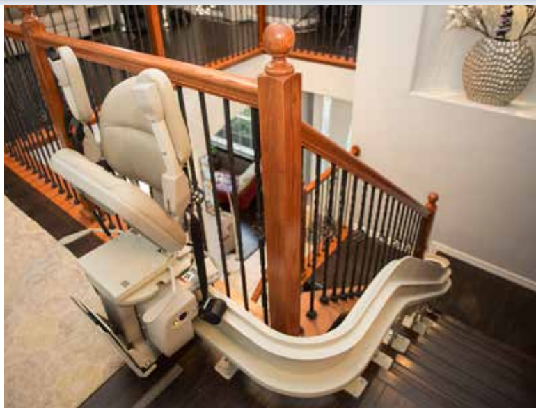
Custom made specifically for your home.