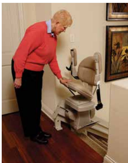
Manual offset swivel seat makes it easy to get on/off. Add the power seat option to make it effortless.