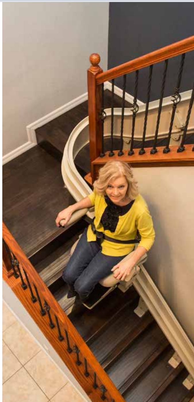
Crafted for a precision fit around curves.